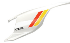
Heritage White II