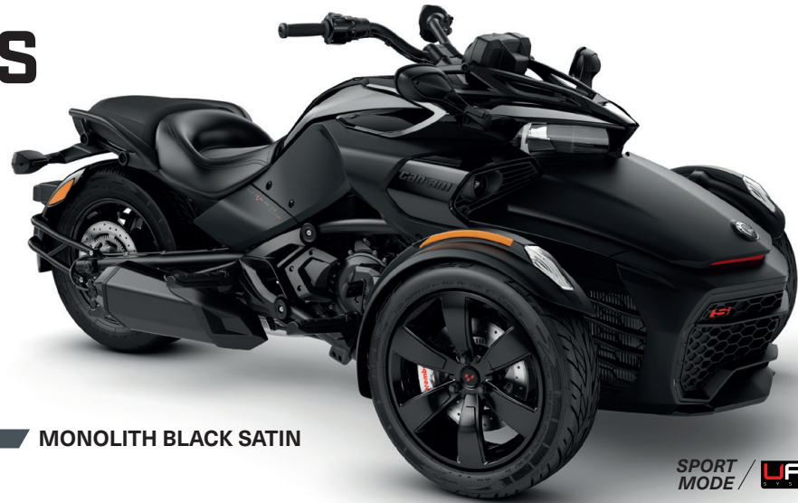
MONOLITH BLACK SATIN