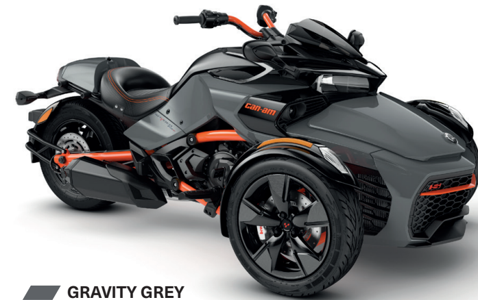
GRAVITY GREY SPECIAL SERIES