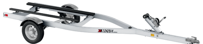
Aluminum MOVE I Extended 1250