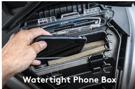
Watertight Phone Box

An innovative hull that sets the benchmark for rough water handling, stability, and offshore performance.