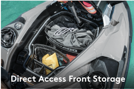
Direct Access Front Storage

Large front storage area that's easily accessible from a seated position. 1 Storage bin organizer included for ultimate convenience.