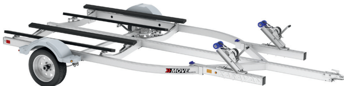
Aluminum MOVE II