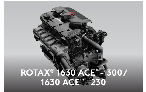
ROTAX ® 1630 ACE ™ - 300 / 1630 ACE ™ - 230

Waterproof and shockproof compartment specifically designed for phone protection. 2