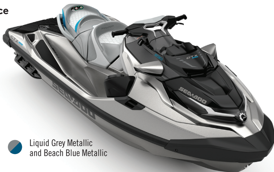
Liquid Grey Metallic and Beach Blue Metallic