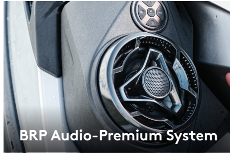
BRP Audio-Premium System

Large front storage area that's easily accessible from a seated position. 1 Storage bin organizer included for ultimate convenience.