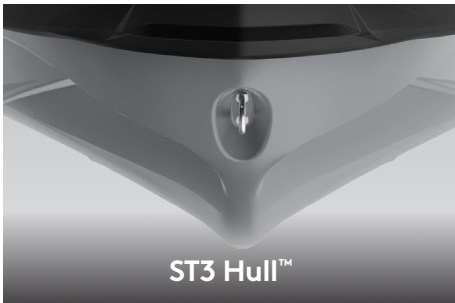
ST3 Hull ™

Exclusive quick-attach system on the largest swim platform in the industry allows for easy installation of storage accessories.