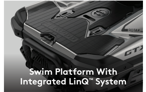
Swim Platform With Integrated LinQ ™ System

The industry's first manufacturer-installed, truly waterproof, Bluetooth ® audio system.