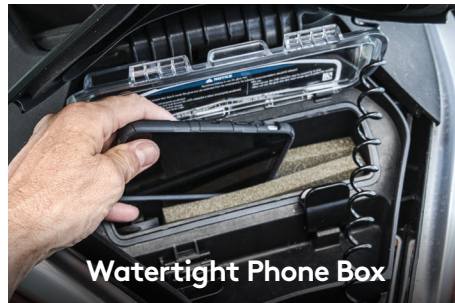
Watertight Phone Box

The Rotax® 1630 ACE - 230 offers instant acceleration by way of a powerful supercharger, while the new Rotax® 1630 ACE™ - 170 is the most powerful naturally aspirated Rotax engine ever on a Sea-Doo.