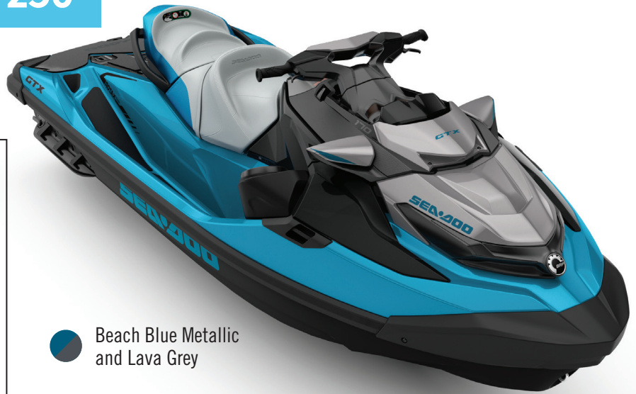
Beach Blue Metallic and Lava Grey