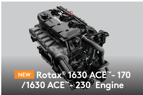
NEW Rotax® 1630 ACE™ - 170 /1630 ACE™ - 230 Engine

An industry-first manufacturer-installed, truly waterproof, Bluetooth ‡ audio system. 2