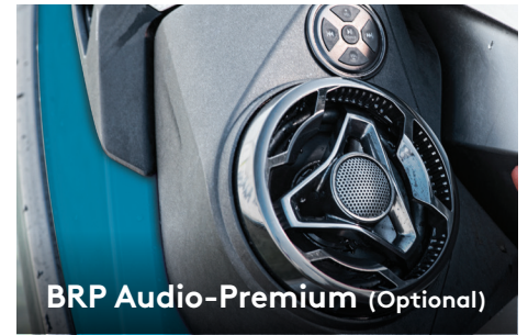
BRP Audio-Premium (Optional)

Exclusive quick-attach system on the largest swim platform in the industry that allows for easy installation of accessories.