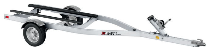
Aluminum MOVE I Extended 1250