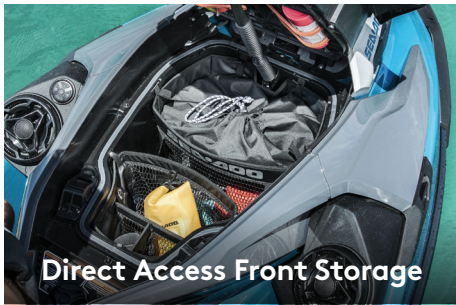
Direct Access Front Storage

Large front storage area that's easily accessible from a seated position. 1