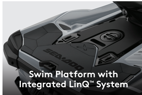
Swim Platform with Integrated LinQ™ System

Large front storage area that's easily accessible from a seated position. 1