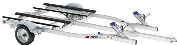
Aluminum MOVE II