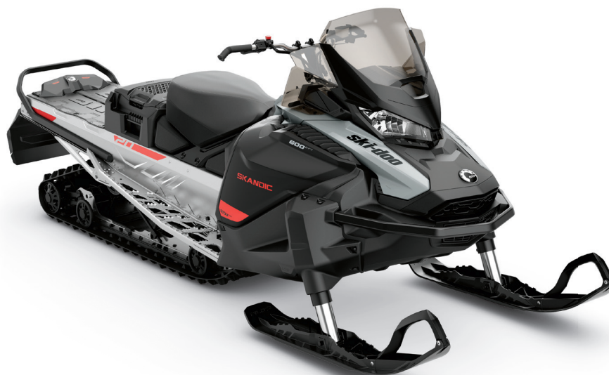
SKANDIC® SPORT 600 EFI SHOWN

The best 20 in. utility value in snowmobiling.