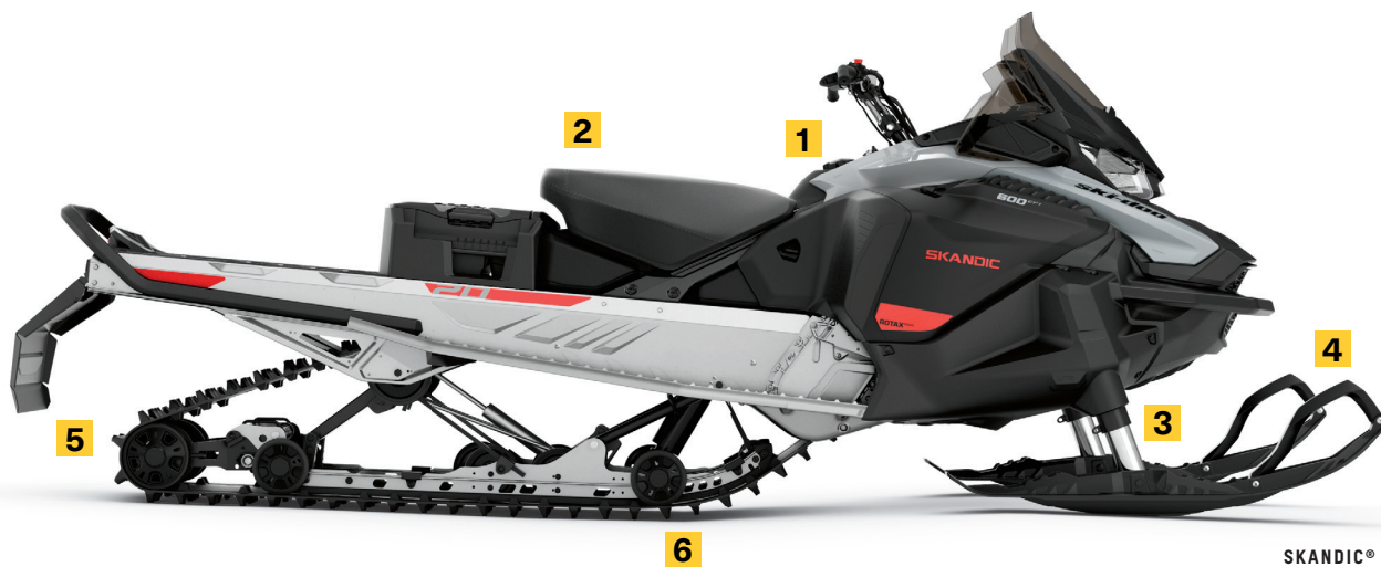
SKANDIC® SPORT 600 EFI SHOWN

Industry-exclusive telescopic front suspension enables a large, flat belly pan for exceptional deep-snow flotation.