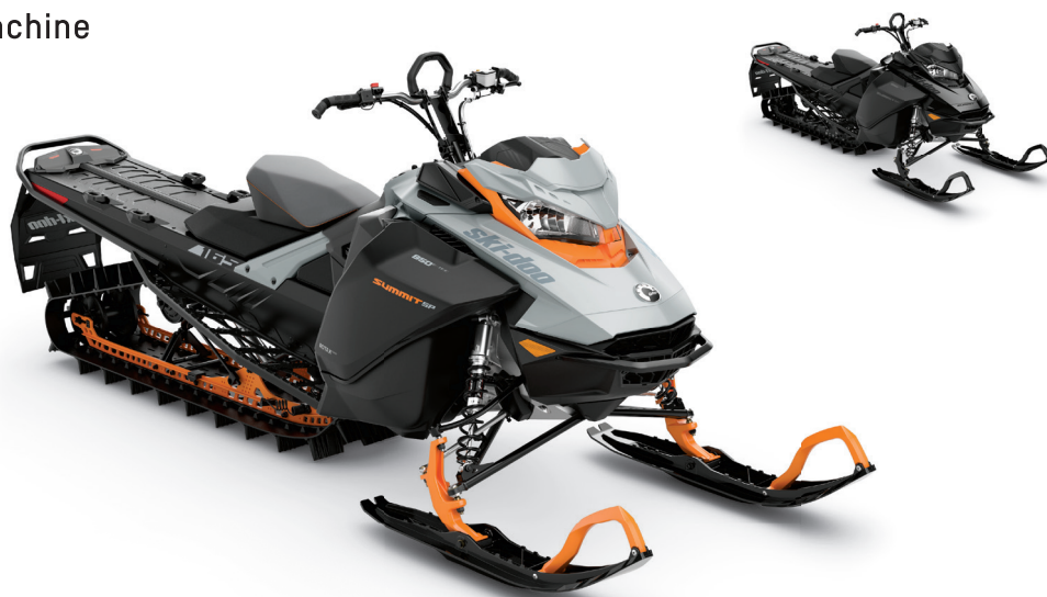
SUMMIT® SP® 165 850 E-TEC® SHOWN

An excellent deep-snow machine for any rider.