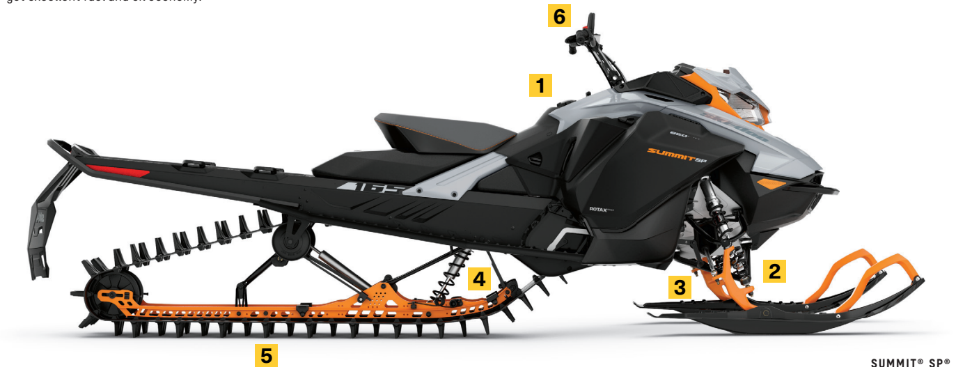
SUMMIT® SP® 165 850 E-TEC® SHOWN

Lightweight alloy spindle with revised geometry and new ski stopper to reduce ski drag for more predictable handling and a confidence-inspiring ride in technical sidehills and rough terrain.