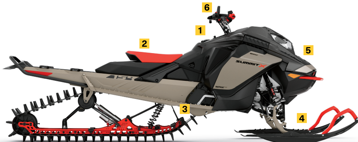
SUMMIT® X® WITH EXPERT PACKAGE 154 850 E-TEC® TURBO SHOWN

Quickly and easily change the limiter strap length for the desired ski lift without crawling under the sled.