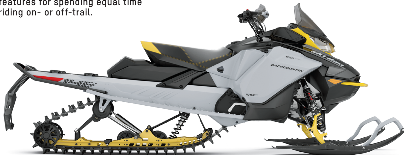
BACKCOUNTRY 146 600R E-TEC SHOWN

Loaded with crossover-specific features for spending equal time riding on- or off-trail.