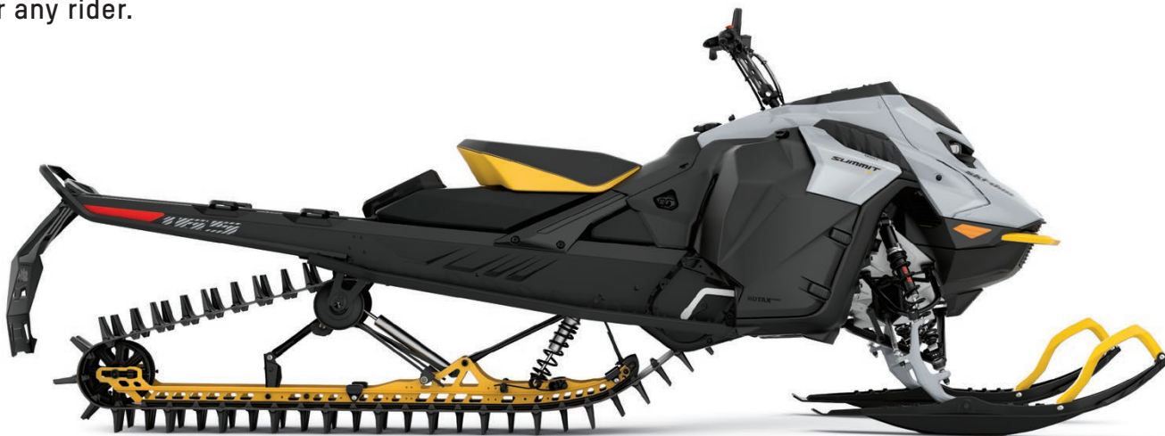
SUMMIT SP 165 850 E-TEC SHOWN

An excellent deep-snow machine for any rider.