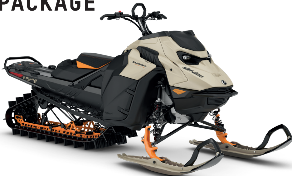
SUMMIT ADRENALINE WITH EDGE PACKAGE 154 850 E-TEC SHOWN

This high-end in-season package is loaded with proven technical features.